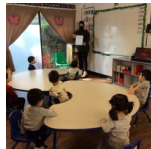
English Phonics Class