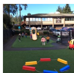
Recess Time/ Exercise