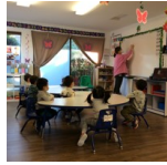
Chinese Theme Class