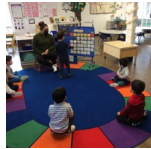
English Circle Time